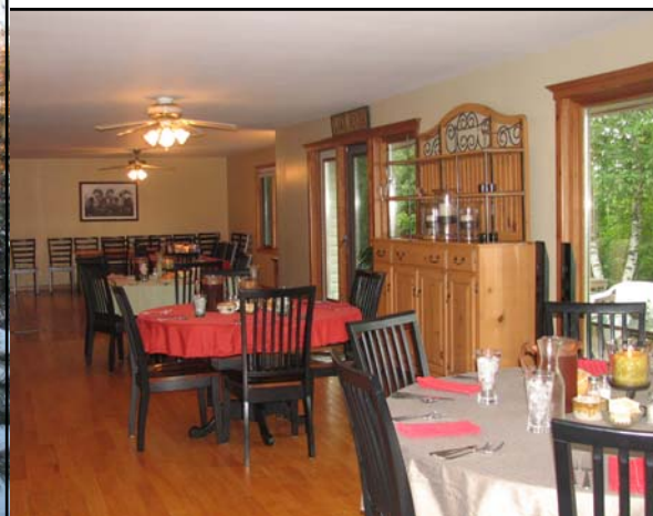
Our extended dining room.